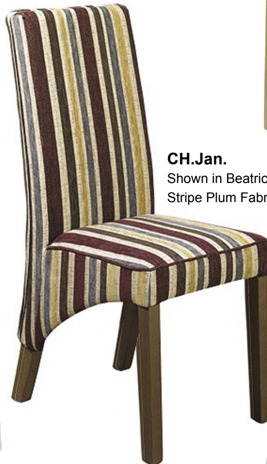
CH.Jan. Shown in Beatrice Stripe Plum Fabric