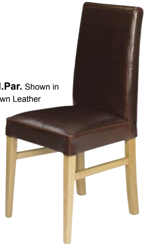
CH.Par. Shown in Brown Leather