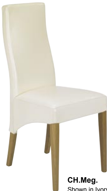
CH.Meg. Shown in Ivory Leather