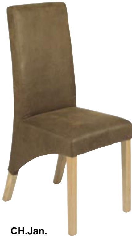
CH.Jan. Shown in Rustic Fabric