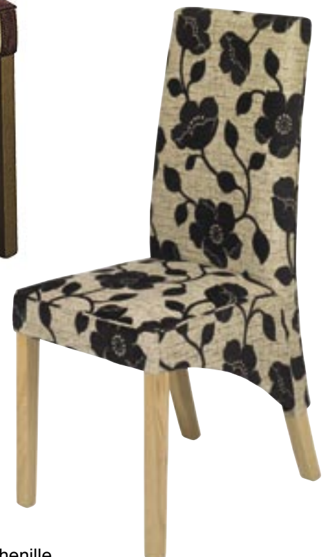
CH.Jan. Shown in Beatrice Chenille Black Fabric EN11